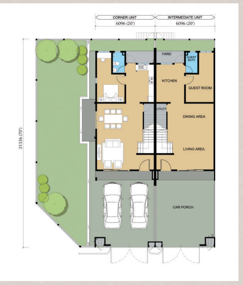
Phase 2 | Ground Floor Plan