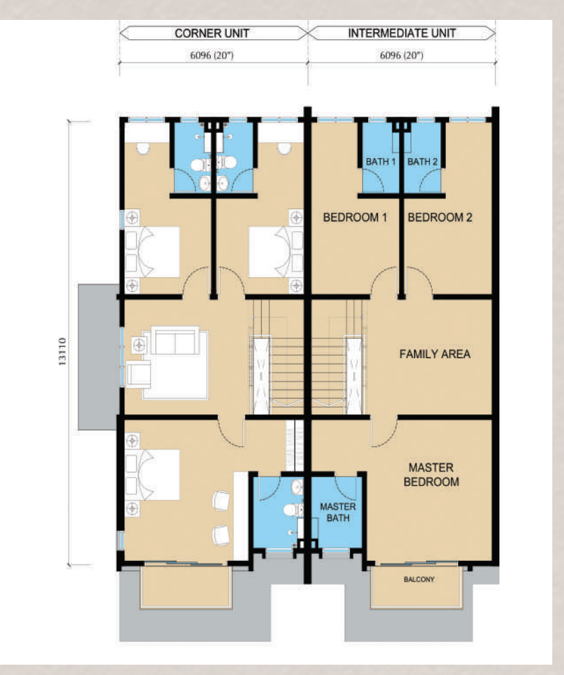
Phase 2 | First Floor Plan